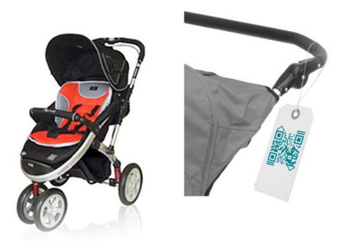
Figure 3. Example of QR-Code for Nano Enabled Product.

QR-codes, which can be scanned via any web-enabled camera phone, store information such as basic text, web links, text messages, contact information, etc., all inside of its graphical image. QR-codes have already been used in other countries and are beginning to appear in San Francisco and New York City. Unlike traditional bar codes, QR-codes can be designed for any product, creating a unique label that is recognizable and distinct from other tags. These new ID tags could potentially be linked to all of the information that the CPSC has struggled to disseminate amongst the public (product recalls, safety incidences, etc.) Figure 3 is one example of how the tags could work in relation to nanoproducts.